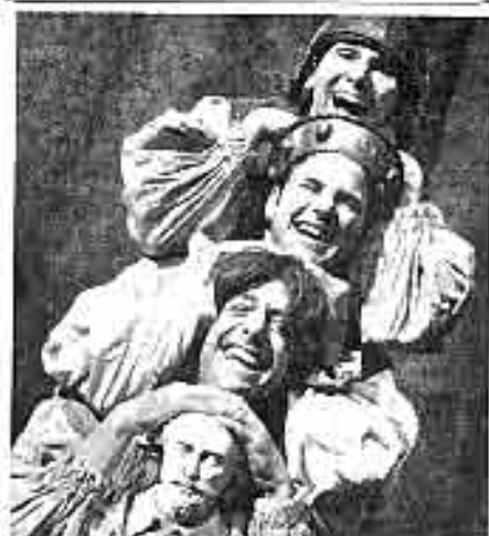
The Complete Works of Wilm Shkspr (abridged) is back for a limited run.